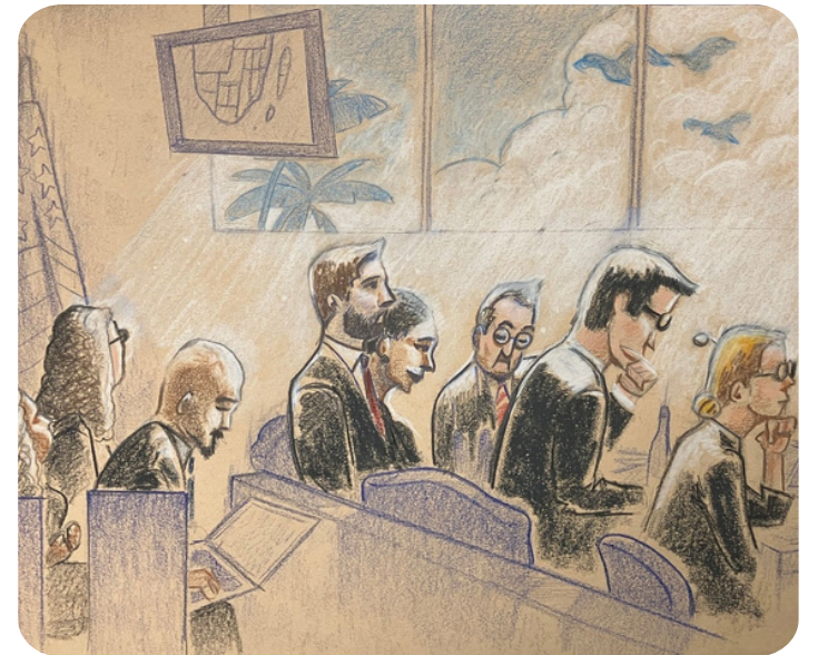
Courtroom sketches are courtesy of @tonio.art