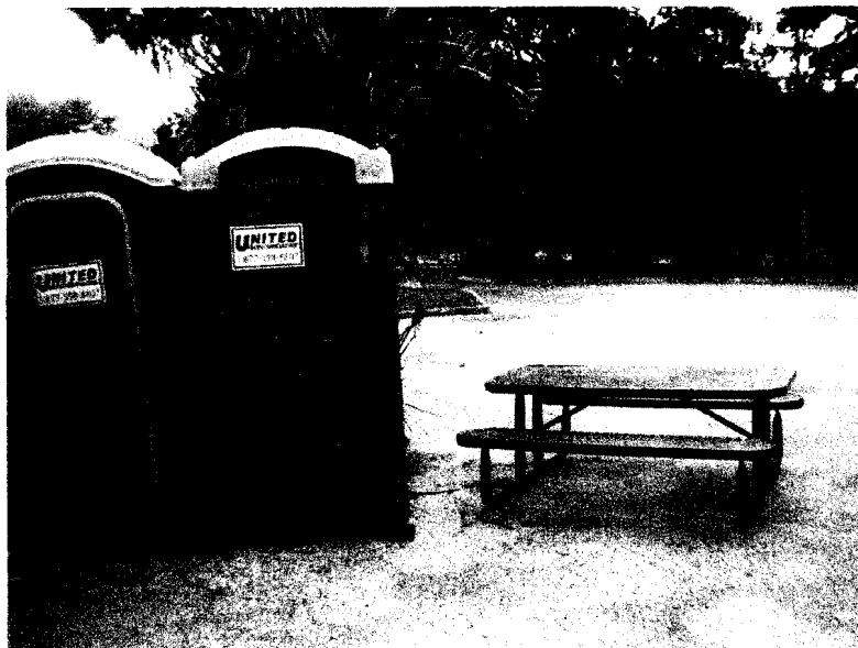
Photograph B-2: The Sylvia Lane location does not have running water or facilities for people to wash their before eating or serving food.