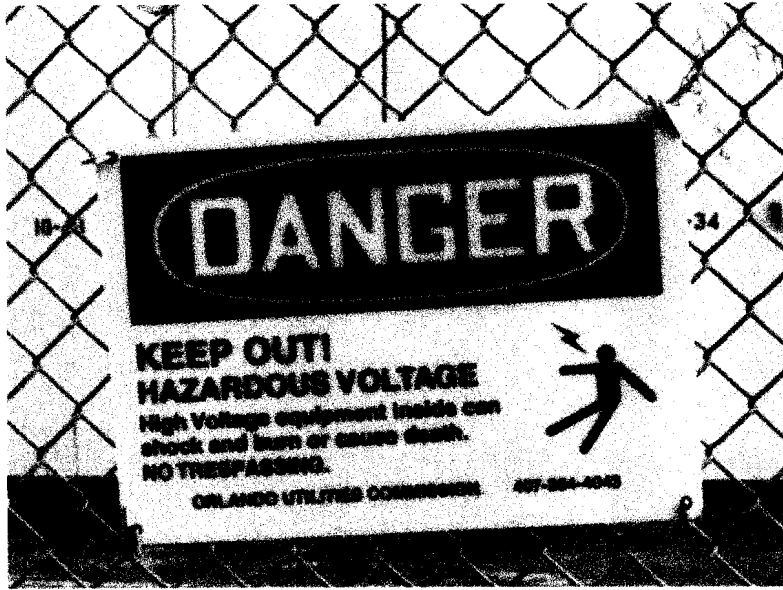
Photograph B-3: This sign hangs on the fence at the Sylvia Lane location.