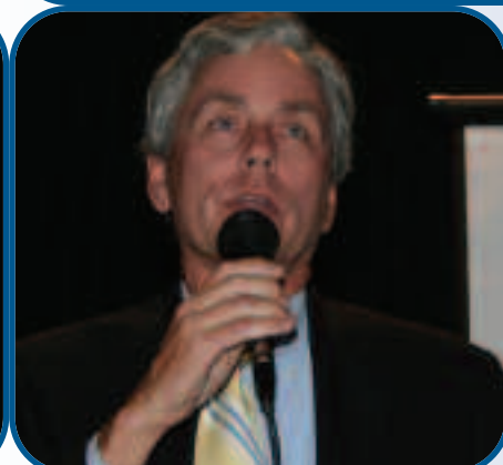
2007 Nelson Poynter Award recipient Carl Hiasen.